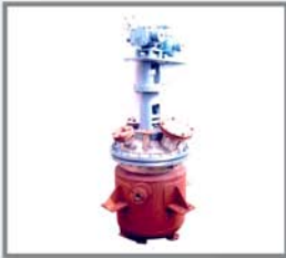
Small Jacketed Vessel