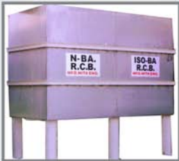
Chemical Storage Tank