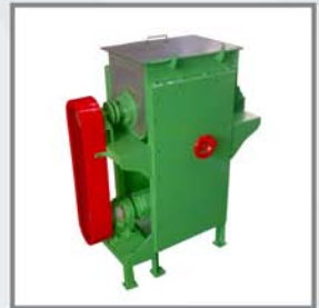
Small Ribbon Blender