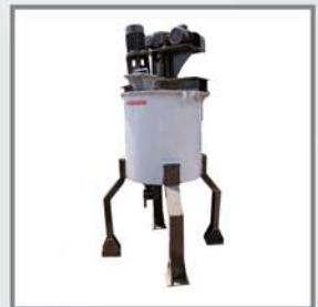
Twin Shaft Starer