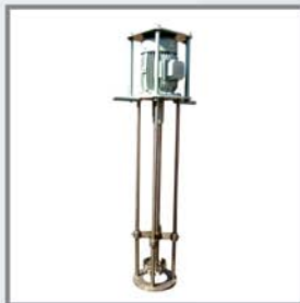
High Speed Starer