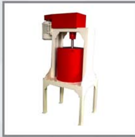
High Speed Mixer