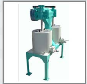
Twin Bead Mill