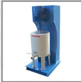
15 Ltr. Bead Mill