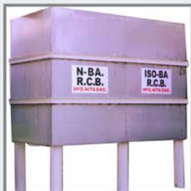
Chemical Storage Tank