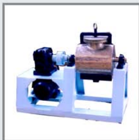
Lab Ball Mill