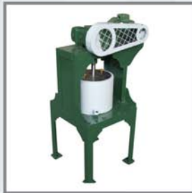
Lab Bead Mill