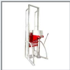
Hydraulic High Speed Mixer