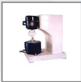
Lab Bead Mill