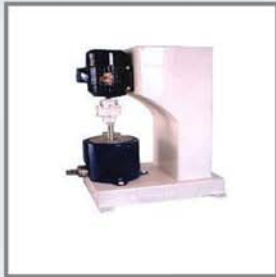
Lab Bead Mill